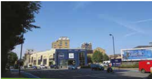
View of existing site looking West along York Road