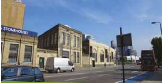
View of existing site looking East along York Road