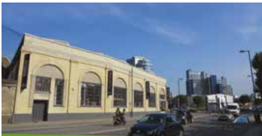
View of Barker and Stonehouse building on site