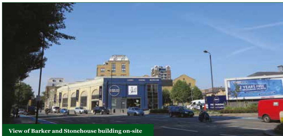
View of Barker and Stonehouse building on-site